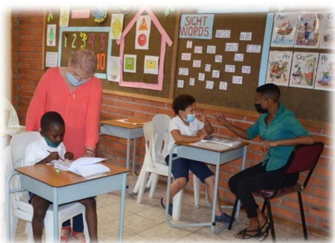
EXAMPLES OF LOTUS CLASS ACTIVITIES